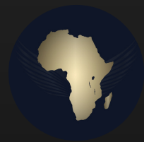
THE UNITED AFRICAN DEFENCE FORCE© (UADF)