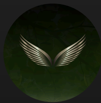
THE NDEGE FOUNDATION©